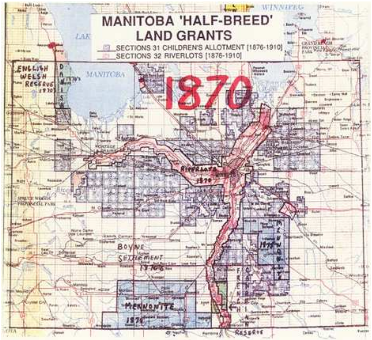
Map developed by Audreen Hourie